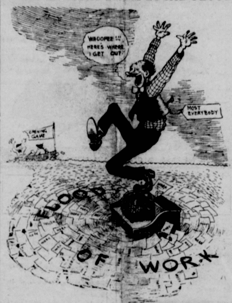
Northwest Baseball Season Opens in Seattle Tomorrow, With Game Between Giants and Portland